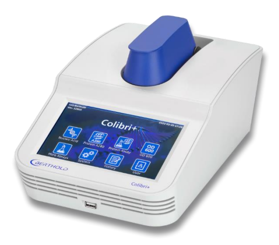
Figure 2 : the Colibri+ is an example for a particularly fast measuring system. The measurement of a sample takes less than 3 seconds.