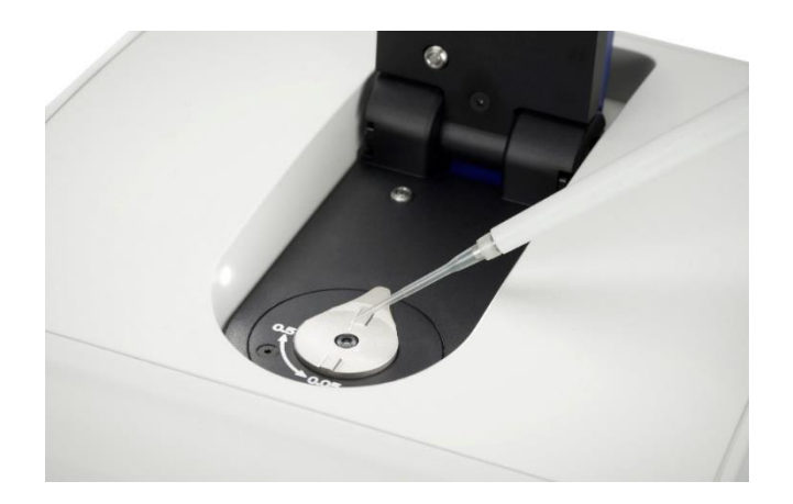
Figure 4: pipetting in the sample area of the Colibri+